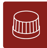
Caps and Closures