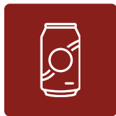
Cans and Ends

PFAS have been and are currently used in many types of food and beverage packaging, such as: